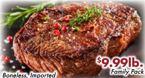
Ribeye Delmonico Steaks