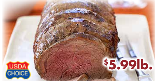
Eye Round Roasts