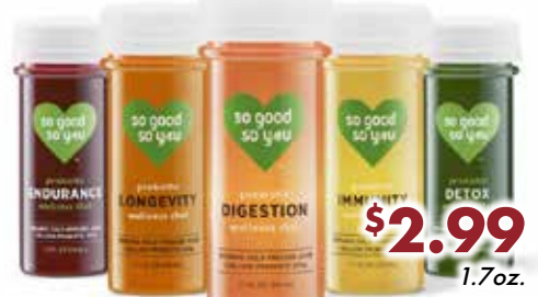
So Good So You Juice Shots