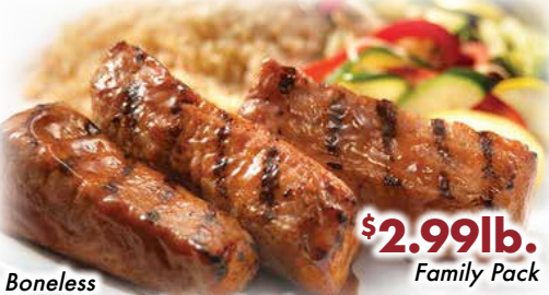
Country Style Pork Ribs Lesser Amounts, $3.19lb.