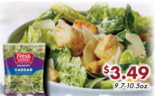
Fresh Express Caesar Kits