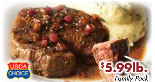
Eye Round Steaks Lesser Amounts, $6.49lb.