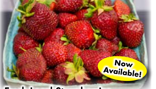
Fresh Local Strawberries