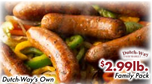
Sweet or Hot Italian Sausage Lesser Amounts, $3.49lb.