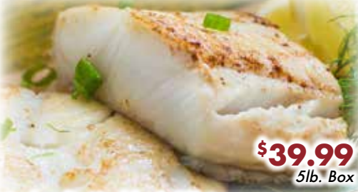
Icelandic Haddock Fillets Lesser Amounts, $8.99lb.