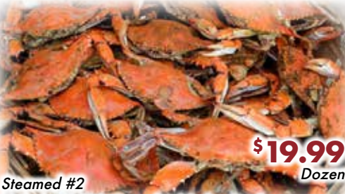
U.S.A. Wild Caught Male Crabs