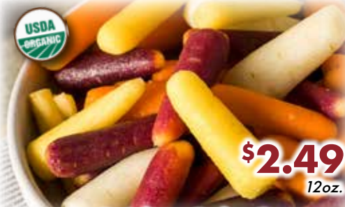
Organic Rainbow Baby Carrots