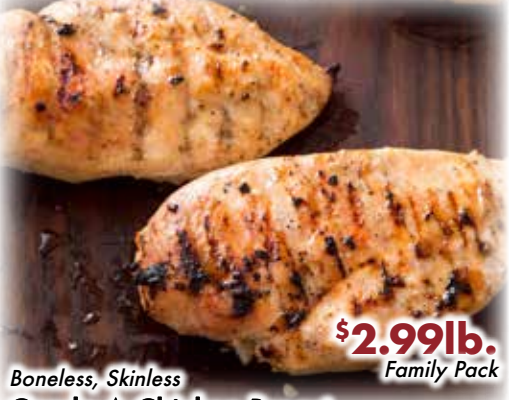
Grade A Chicken Breast Lesser Amounts, $3.49lb.