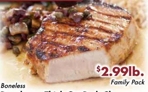
Regular or Thick Cut Pork Chops Lesser Amounts, $3.19lb.