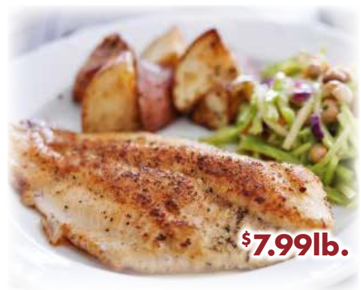
Fresh Tilapia Fillets