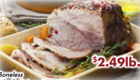
Chefs Prime Pork Roasts Center Cut Pork Roasts: $2.69lb.