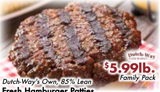
Fresh Hamburger Patties